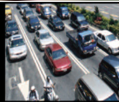
DIS Digital Image Stabilization